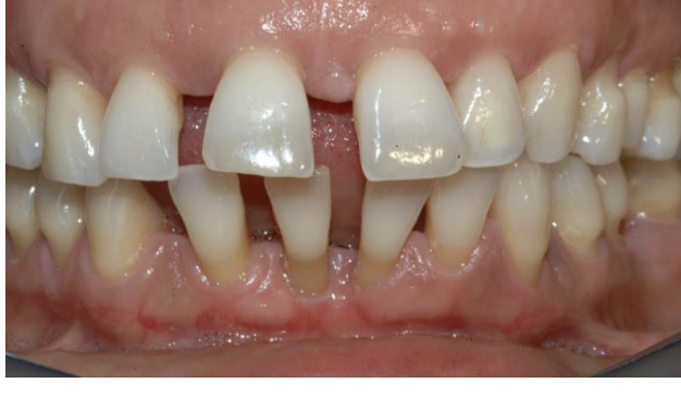
Diabetic periodontal disease